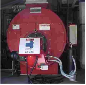
The recent installation at the Ina Paarman factory in Diep River, Cape Town