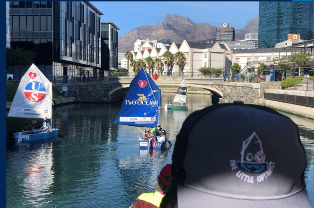
Sailing Therapy at our Sailing Academy- V&A Waterfront, Cape Town, South Africa