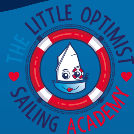
Kids learn the ropes at a sailing therapy session

NSRI, Aquarium Foundation, Sailing South Africa, Paris 2024, V&A Waterfront