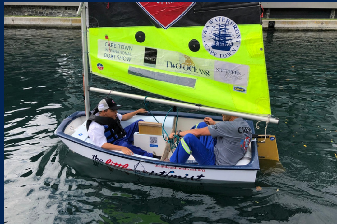
First time in a boat and learning to sail in the V&A Waterfront